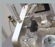
Adapter for small pieces