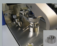
Adapter for wires with a diameter of 0.8-3 mm