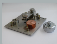
Small parts adapter kit

Material control presents a wide range of analysis requirements. Two specific challenges: adjusting to samples' differing shapes and sizes, and optimizing positioning on the spark stand. Fortunately, SPECTROMAXx's adapter kit offers a variety of flexible, easy-to-use solutions.